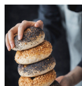
Bagels: plain, poppyseed or onion