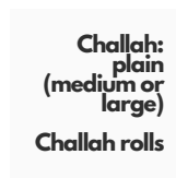
Challah: plain (medium or large) Challah rolls